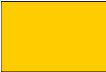
Unexposed Approximated pantone: 7548